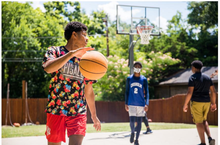
A Safe Place to Play