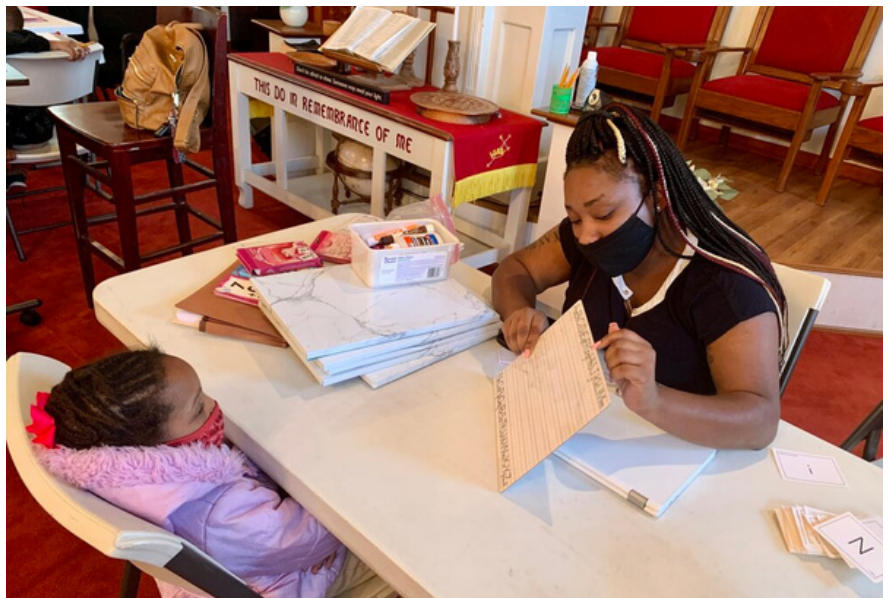
Homework Help Program