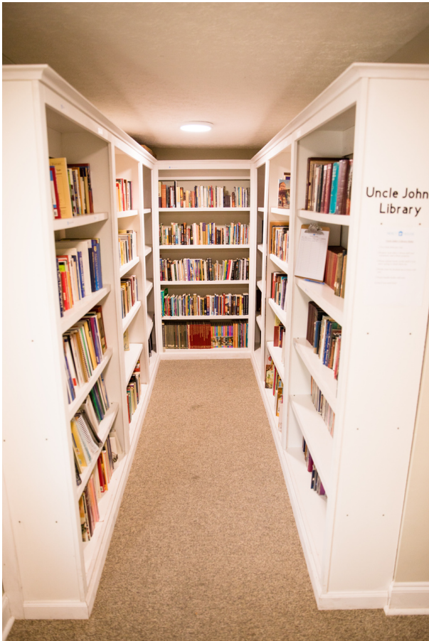
Uncle John's Library